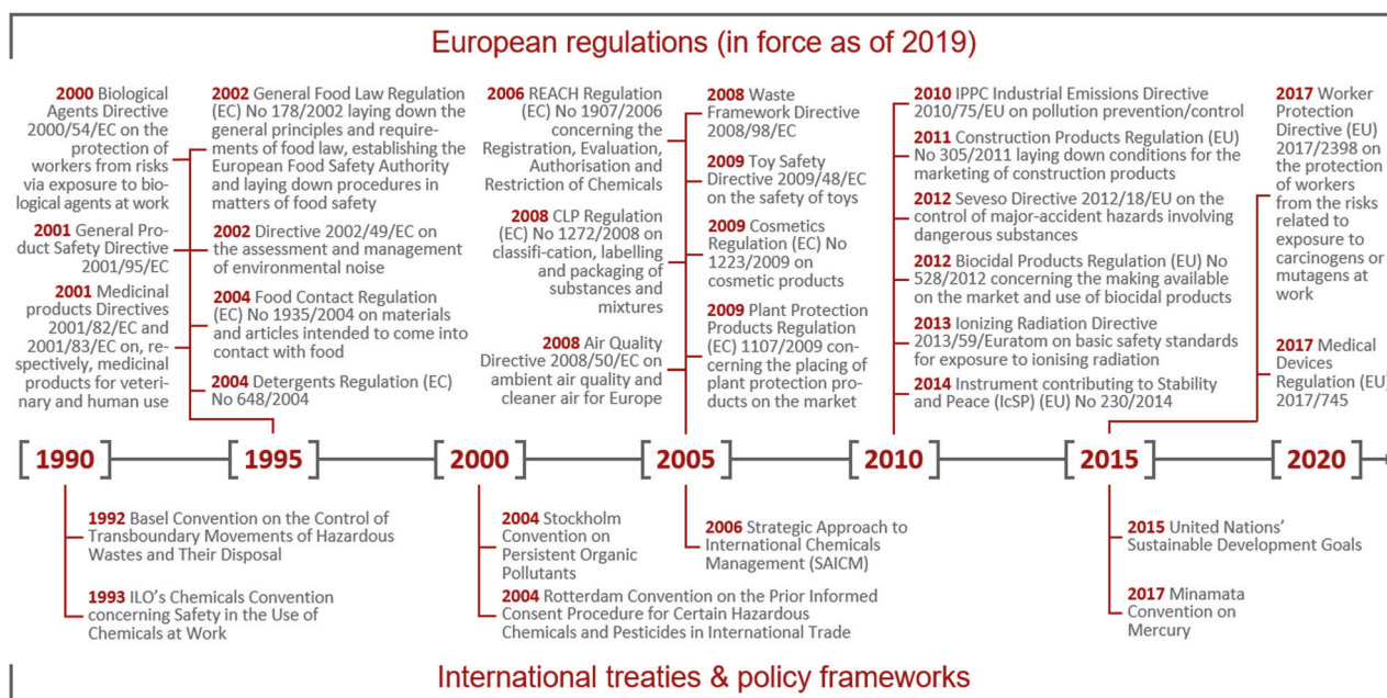
Fig. 1 List of major European regulations, and international treaties and policy frameworks currently in force, where exposure information in relation to different stressors is an essential element. Note that only

those regulations are listed that are still in force, while exposure information might have been already introduced in preceding regulations (e.g. Council Directive 91/414/EEC for Plant Protection Products)