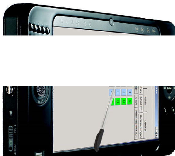
Figure 1 Ultra mobile PC.

The developed software was implemented in an Ultra mobile PC (UMPC). An UMPC is a small handheld laptop with a pressure-sensitive screen (see figure 1). It measures