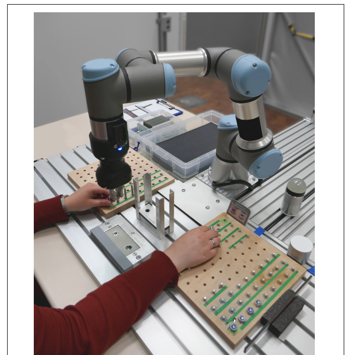
FIGURE 1 | A collaborative robot in an HRI setup.

Task allocation is described by Abdallah and Lesser (2005) as a problem appearing whenever a task cannot or is not supposed to be conducted by one agent alone. The field of task allocation has been dominated by the question who, man or machine, can perform a certain operation better (e.g., MABA–MABA principle by Fitts, 1951; Dekker and Woods, 2002) and the aspiration to automate everything possible and leave the “rests” for humans (McCarthy et al., 2000). This thinking is still quite present today, but for current developments in the production sector toward faster, more individualized production in more flexible settings able to be rearranged they are probably not appropriate. The upcoming collaborative robots (see e.g., Figure 1 ) can be a technological support for mastering these new affordances.